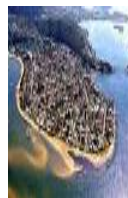
Brisbane Water Bridge Club - Woy Woy